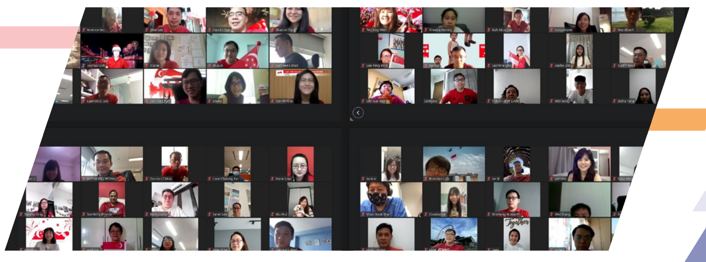
CRA officers celebrate National Day 2020 virtually together.

Not forgetting to do our part to support CRA's climate change goals, CRA officers also actively posted our "green efforts" on Workplace as part of the "I did a Green Action" Corporate Challenge to share "green" tips and advice with fellow officers.