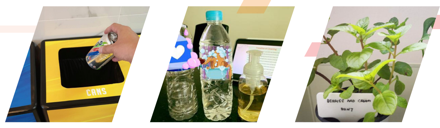
CRA officers sharing their environmentally friendly actions with fellow colleagues to support CRA's climate change goals.

CRA officers continued to interact with one another and stay engaged via virtual workshops, retreats and team-bonding events. Guests were also invited to give virtual lunchtime talks on self-care such as stress management and cultivating positive thinking.