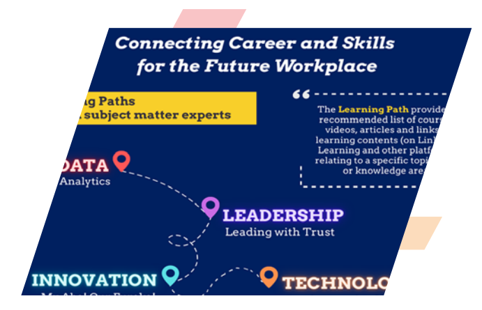
Learning Paths for CRA officers.

These Learning Paths provide useful recommendations on relevant courses and content across various platforms, including LinkedIn Learning, for CRA officers to deepen their knowledge and capabilities on these topics. Such learning and development initiatives complement existing mandatory courses which have been put in place for foundational competencies in data analytics, design-thinking and technology literacy, to better prepare our officers in becoming a future-ready workforce.